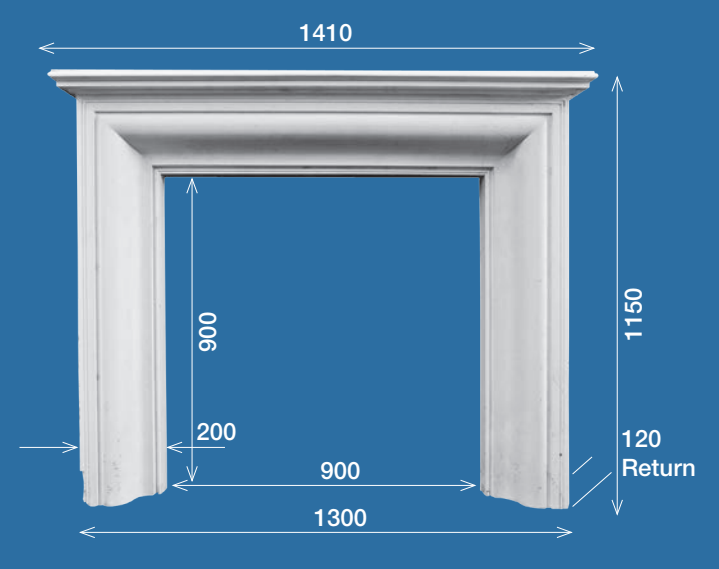
BFP 006 • 900 x 900/D. 130, mantle 180